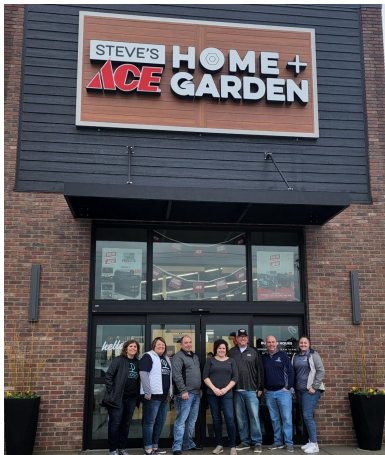
Welcome to Peosta! We are excited you are here!