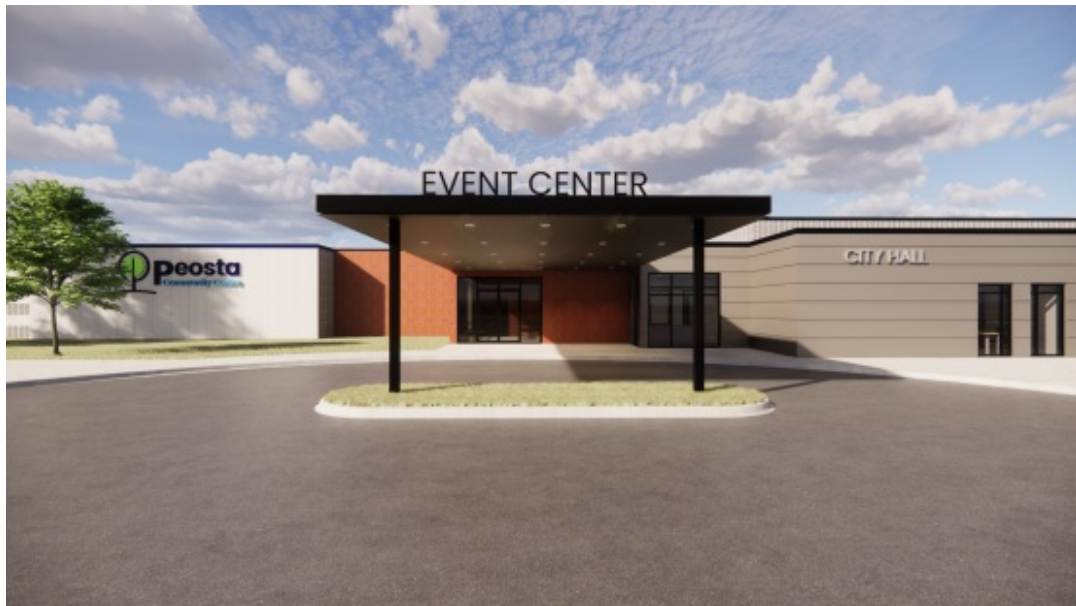
Peosta Community Centre Project Architectural Concept